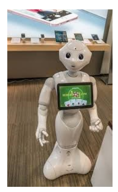
Figure 2 LectureBot

Robotics is a major domain of AI that establishes robots as artificial agents of real-time environments. Here, we use them as teaching agents that offer regulation, monitoring and explanation to track the learner's mental steps. The lecturebot comes with an LED screen on the robot which projects several 3D illustrations with the help of dynamic graphical user interfaces. It can substitute for lecturers and reconstruct the non-verbal behaviour of the lecturers as well.